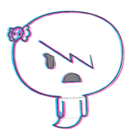
To add colour and give Carrie her 3D look, go over the outline again with pink and blue colours.