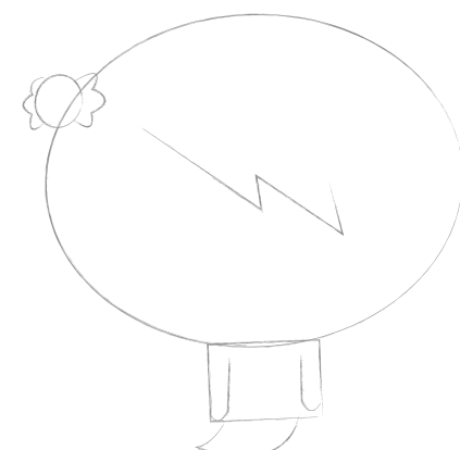
Draw in the details of the bow. Add a zig zag in the middle of the circle for her fringe. Be sure to include her arms by her side.