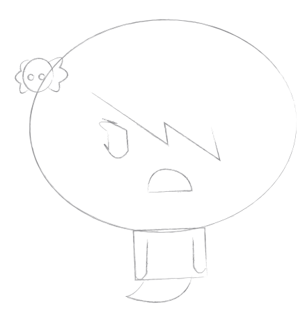
Finish her off by drawing in her face. An angry eye and a semi-circle makes her look like she is annoyed at Gumball (again!).